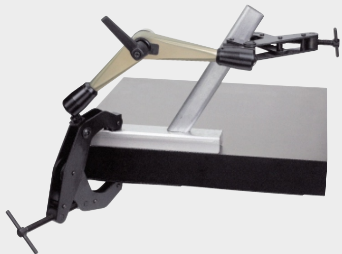
Holding and positioning of welding parts