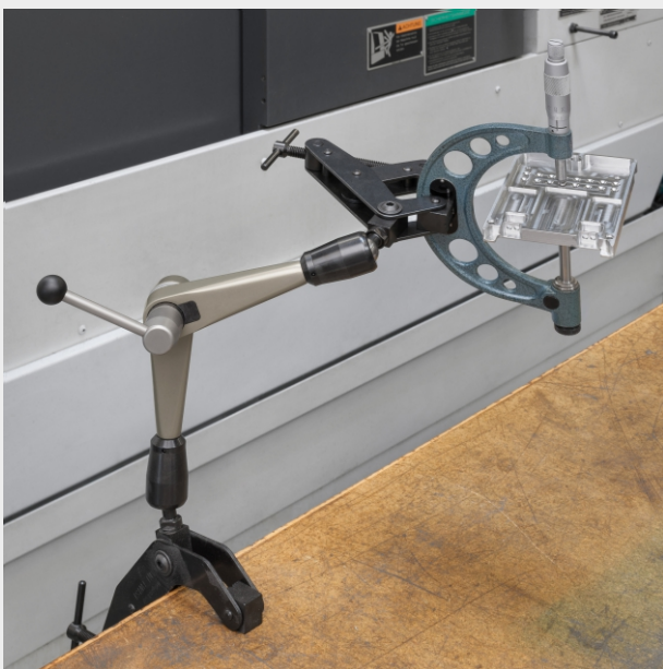
Holding a micrometer