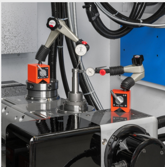
Concentricity and axial run-out test